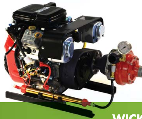
WICK F200-23BS™ (CHANNEL FRAME / HORIZONTAL SPEED INCREASER MODEL)