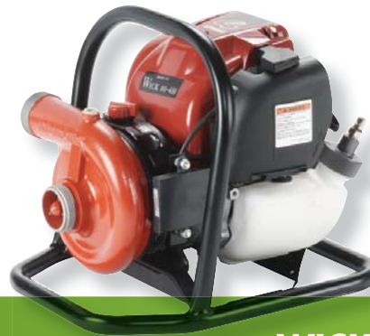
WICK® 80-4H (RFTC MODEL)